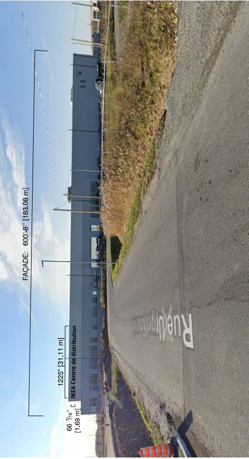
Enseigne PROPOSÉ pour un minimum de lisibilité: 52m